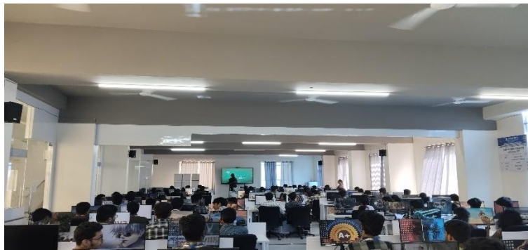
18-10-2024, 9:20 AM – 12:40 PM (AI&ML and CSD: Room No.7311)