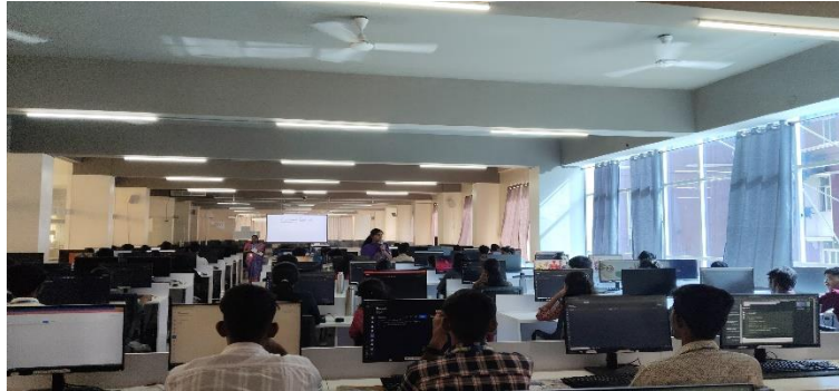
18-10-2024, 9:20 AM – 12:40 PM (IT: Room No.7111)