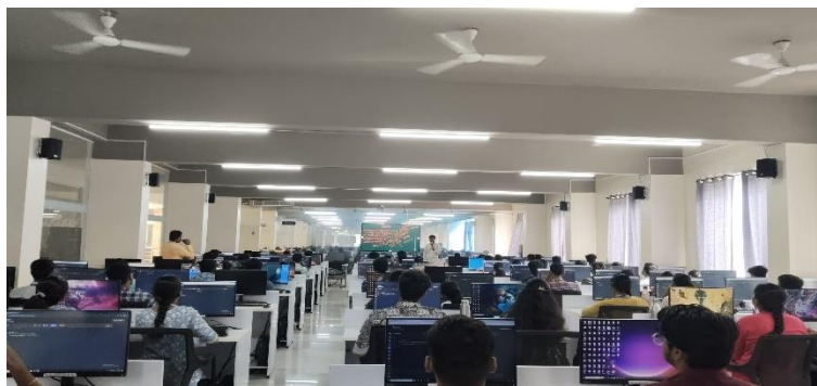
18-10-2024, 9:20 AM – 12:40 PM (IT: Room No.7112)