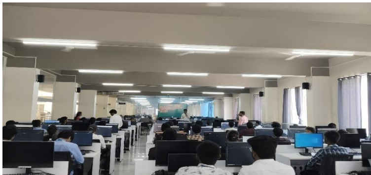
18-10-2024, 1:20 PM – 4:40 PM (ECE, CSE and CSE(AI&ML)): Room No. 7112)