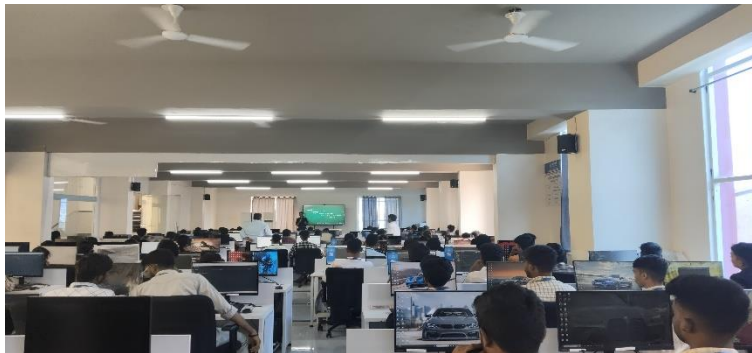
18-10-2024, 1:20 PM – 4:40 PM (CSE: Room No. 7311)